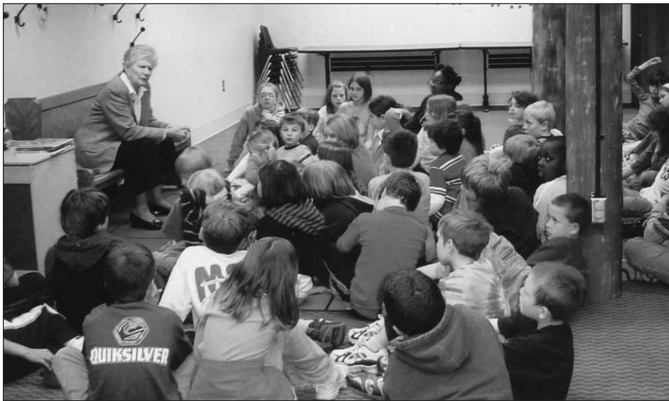
Sen. Pat Vance participated in National Library Week in April by reading to third-grade students from Northside Elementary at the Joseph T. Simpson Public Library in Mechanicsburg. In addition, she answered questions from the students.

The Senate also is working to eliminate the exemption for political parties. Senate Bill 820, which I cosponsored, would make it illegal for any political candidate or organization – including so-called 527 groups – to make automated political calls to any resident who signs up to be on the list. The bill passed the Senate in April and is now in the House State Government Committee.